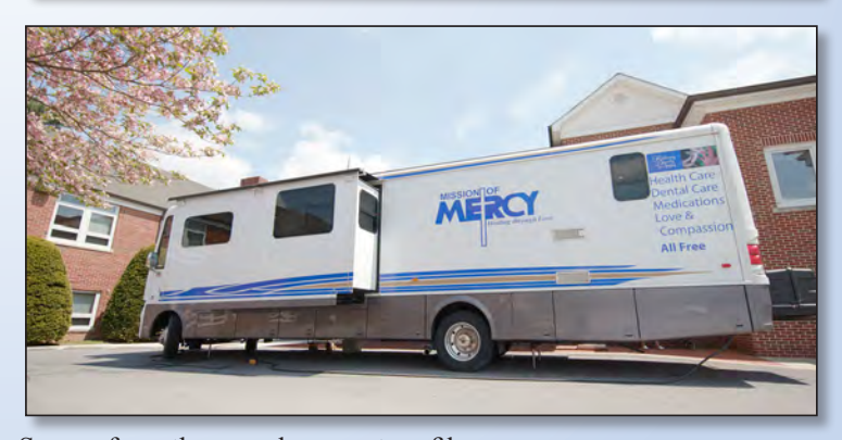
Scenes from the new documentary film.